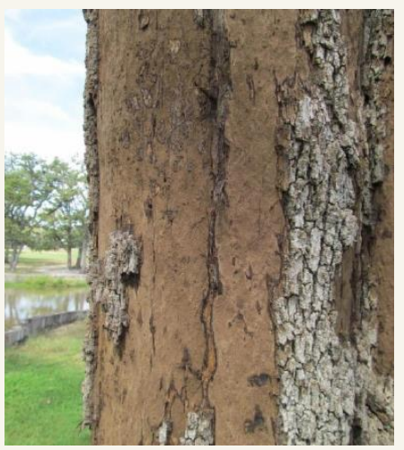
Figure 1 Hypoxylon Canker Mat

We might be well into fall, but that does not mean everything is going dormant. A relatively warm early fall mixed with high moisture and humidity seen over the past couple weeks are encouraging the spread of fungal diseases among trees and woody brush all over the county, particularly in oak and pine trees.